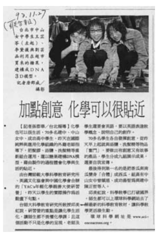
Article about YAC in the United Daily News (Taipei, Taiwan)