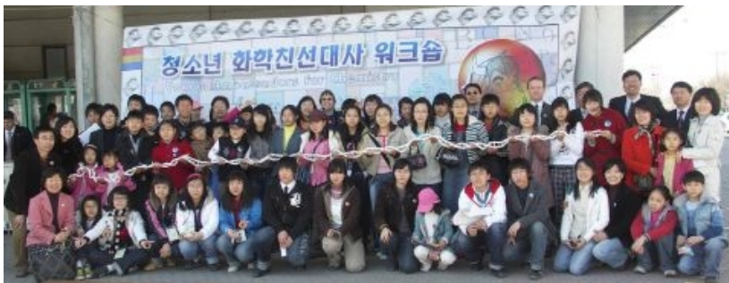
Visibility: participants in Taiwan (left) and all YACs in Korea (right)