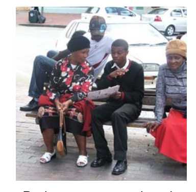
Roving reporter questions the public in Grahamstown, South Africa

This last question showed a variety of answers from negative: 'chemicals are dangerous', theoretical: 'mercury is very heavy and sulphur is very yellow', 'I still remember the tests for the gases and most of the Periodic Table', practical: 'I know that chlorine kills harmful bacteria in water' to appreciative: 'we did not have these kinds of things in our generation, but we are glad for our children'.