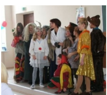
Science theatre in Krasnoyarsk, Russia