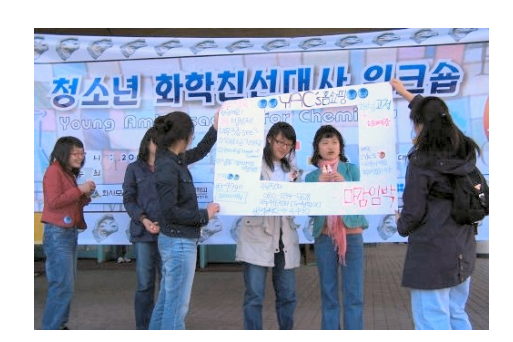
Winning TV commercial in Gwangju, Korea

Our juries had the hard job to choose the student groups with the best TV commercials. In Grahamstown, South Africa we watched 18 creative commercials! At the end of the day, the winning groups received their prizes and all students were offered a certificate of recognition and presents from the different participating sponsors.