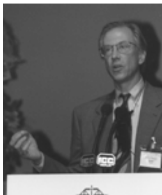
Prof. Dr. Thomas R. Cech

Eight plenary lecturers, including four Nobel Prize winners, headlined an array of leading chemists from around the world reporting on their latest research findings in medicine, agriculture, nutrition, and the environment. The first plenary speaker, Prof. Dr. Thomas R. Cech (1989 Nobel Prize winner) of the Department of Chemistry and Biochemistry, University of Colorado, Boulder, CO, USA, discussed "RNA in Catalysis: Ribozymes and Telomerase". He showed how some RNA molecules called ribozymes fold to form active sites for biochemical reactions in the complete absence of proteins, while other cellular catalysts are ribonucleoprotein (RNP) particles that contain essential protein and