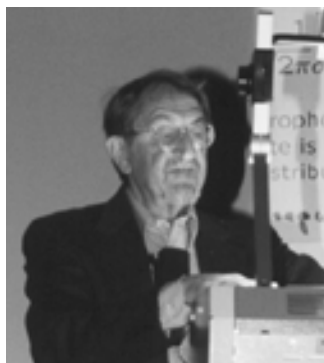
Prof. Dr. Martin Karplus