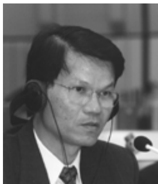
Prof. Dr. Chi-Huey Wong

charides play in numerous biological recognition events (e.g., bacterial and viral infection, cancer metastasis, and inflammatory reactions), the pace of development of carbohydrate-based therapeutics has been relatively slow. Prof. Wong suggested that this slow pace is further hindered by the lack of practical synthetic and analytical methods available for carbohydrate research and by the problems associated with undesirable properties of carbohydrates as drug candidates. He showed how recent advances in the field, however, have demonstrated that many of these problems can be circumvented with the use of chemo-enzymatic synthetic methods and carbohydrate mimetics, i.e., small molecules that contain the essential functional groups (often with additional hydrophobic or charged groups) to resemble the active conformation of the parent structure.