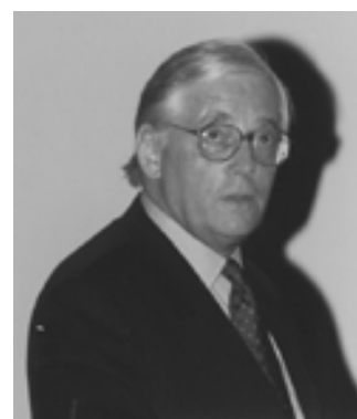
Prof. Dr. Sir John E. Walker