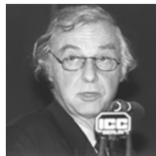
Prof. Dr. Robert Huber

Prof. Dr. Robert Huber (1988 Nobel Prize winner) of the Max-Planck-Institut für Biochemie, Martinsried, Germany delivered the final plenary lecture at the closing session of the Congress. His topic was "Biomolecular Cages for Protein Folding and for Protein Degradation". He demonstrated how recent crystal structural studies of the Thermosome, an archaeal homolog of the eukaryotic chaperonin CCT, of the yeast 20S proteasome, and of the E. coli HsIV protein, provide detailed views of the subunit structures and arrangements of these large homo- or hetero-oligomeric complexes. All three complexes observed are closed in their respective crystal forms, and the cavities are quite inaccessible from the outside such that substantial rearrangement of segments, domains, or subunits is required for macromolecular substrate entry and binding. Prof. Huber showed that binding of ATP and its analogs induces small local changes and large domain rotations in the thermosome, possibly representing intermediates between closed and open forms in the catalytic cycle, but leaves the overall conformation closed in all crystal forms studies. He pointed out how very detailed structural information is available for proteolysis by the proteasome through small substrate binding studies and mutagenesis experiments that explain the specificity, processivity, and preferred length distribution of its peptide products.