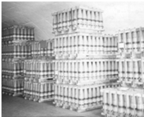
Figure 1. Artillery shells containing the nerve gas sarin (GB) inside a storage bunker at the Umatilla Chemical Depot in Oregon.

buried chemical weapons or to be contaminated with chemical agents.