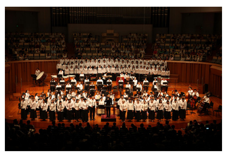
"Joy in Chemistry" Concert in National Center for the Performing Arts, May 24, 2011