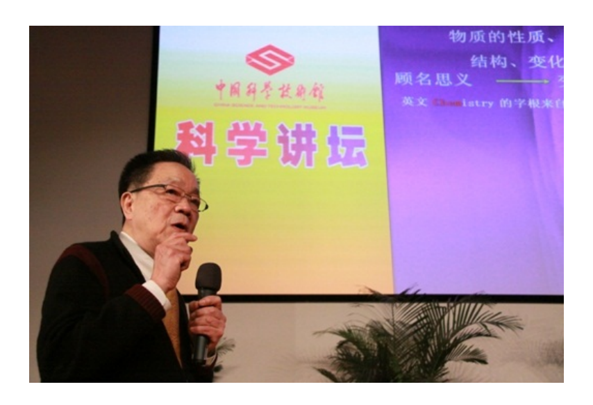
IYC in China: Popularization of Chemistry, Feb 19, 2011

A serial popularization lectures, one lecture a month, will be given by Chinese Academy of Sciences members at China Science and Technology Museum, Beijing.